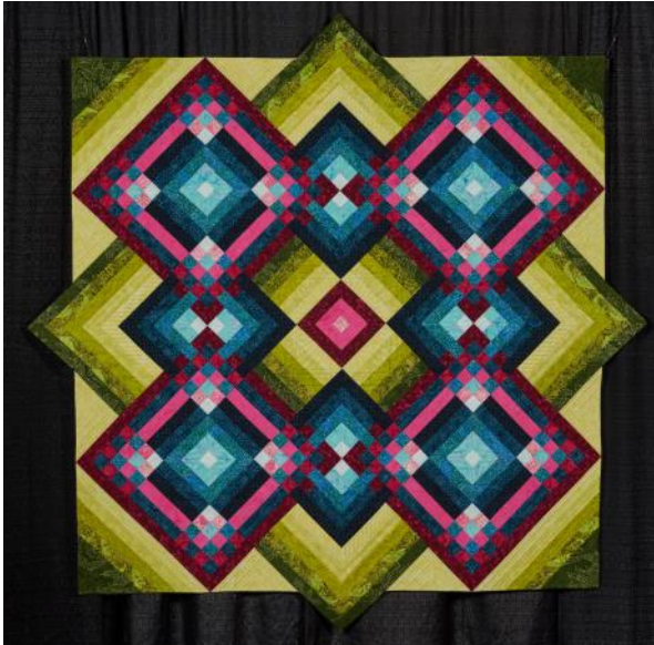
“Psychedelic Carpenter Square”